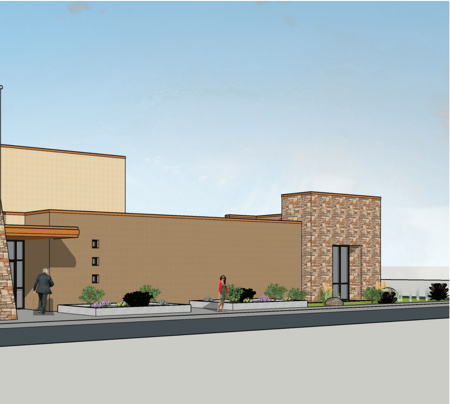
Roswell, New Mexico. Remodel to be completed summer 2019.