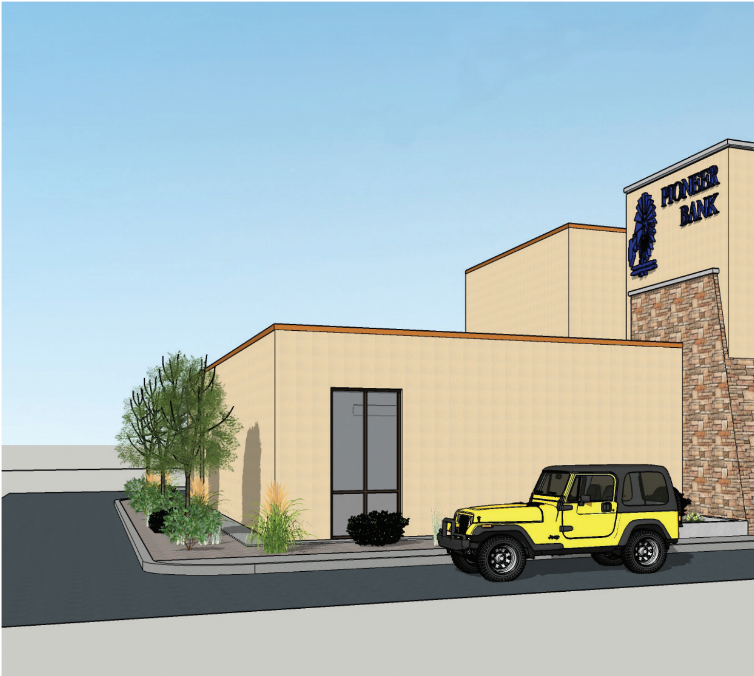
Rendering of Pioneer's branch located at 306 N. Pennsylvania Ave,