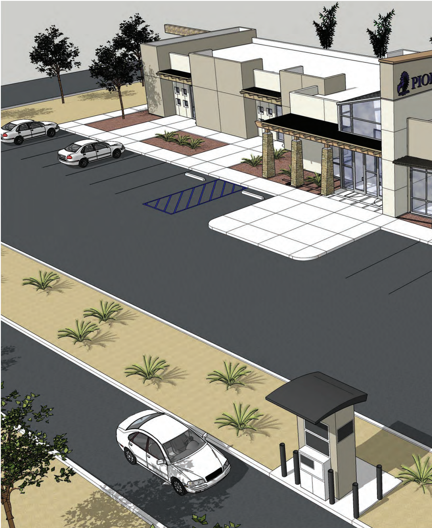
Rendering of Pioneer's rebuilding of the branch located at 2900 N. Roadrunner